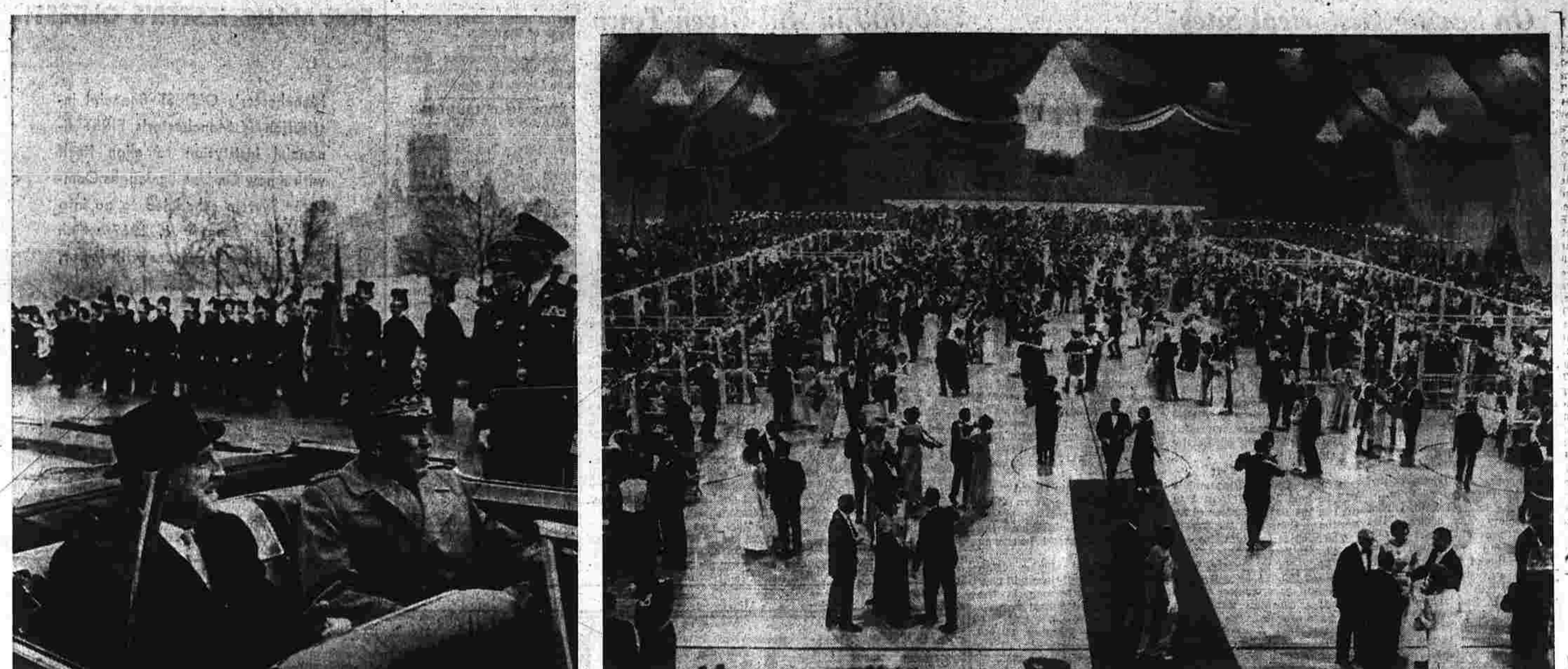
They danced until 2 o'clock in the morning to the music of the Lester Lahin Orchestra in the armory decorated in a Colonial setting.