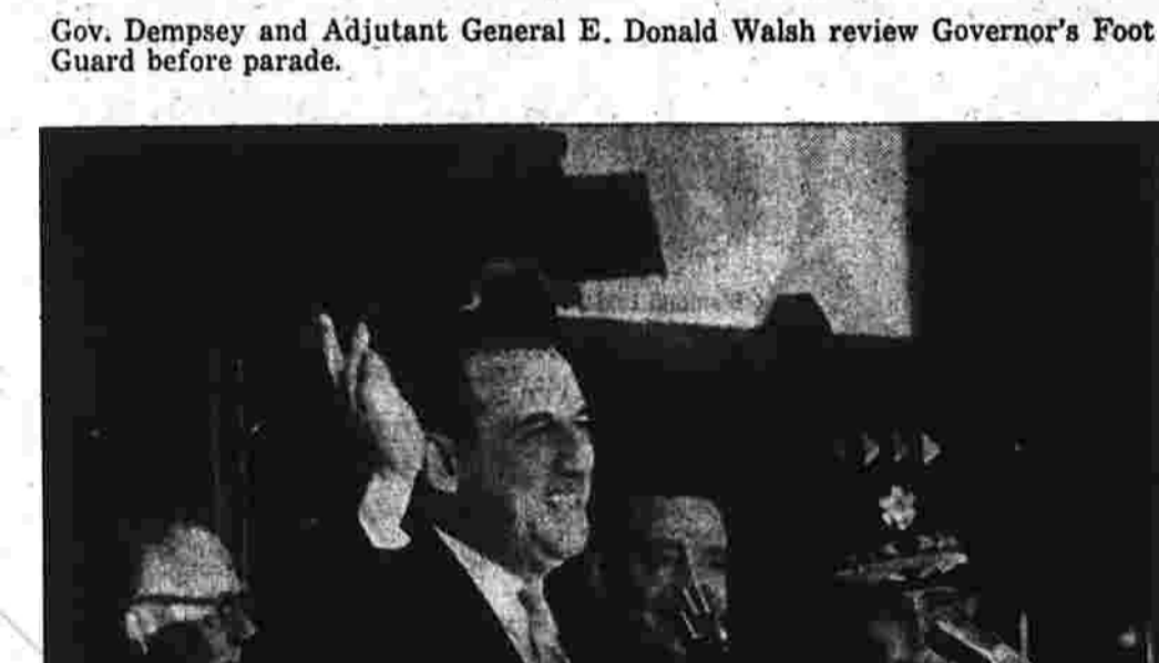
Governor acknowledges applause after taking oath.